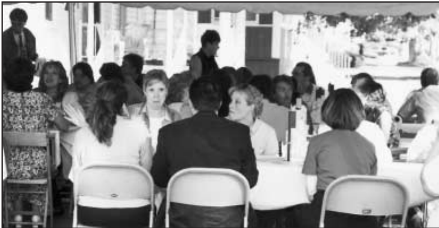
It was a perfect summer afternoon when Chamber members arrived at the tented entrance to the NeighborWorks Home Ownership Center on Genesee Street in Utica for the June Business After Hours networking event. Within minutes, members were enjoying the outstanding picnic Bar BQ under the big tent.