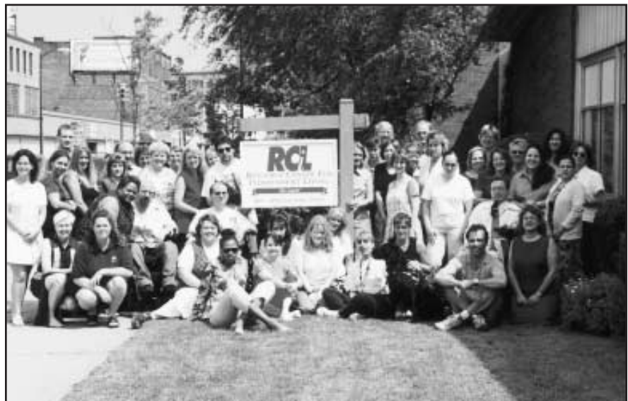
The individuals who make up RCIL's winning team