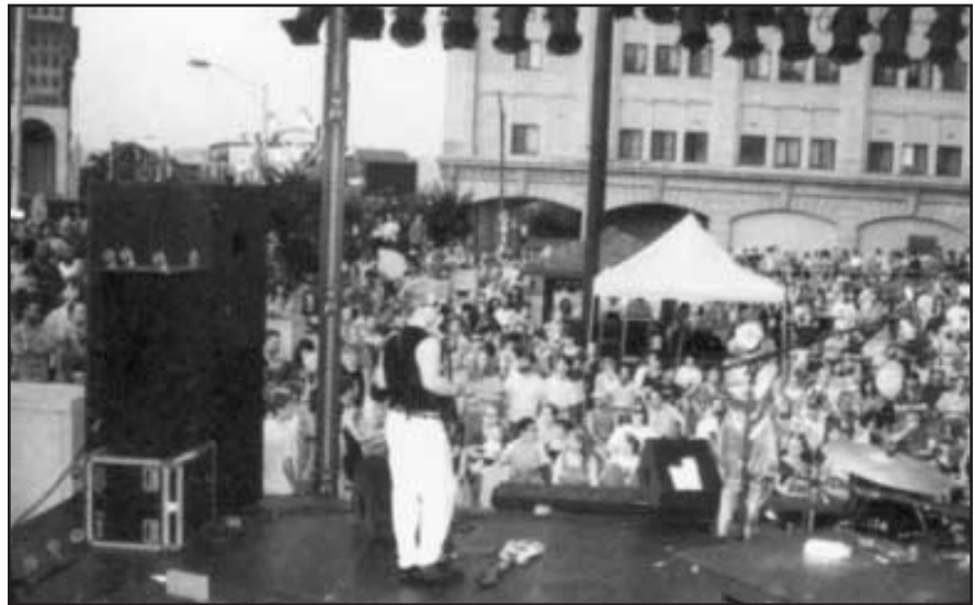
Genesee Street will look like this again July 9-13 for A Good Old Summer Time.

The Office Olympics, sponsored by Hummel's Office Plus, return July 9 with Opening Ceremonies and presentation of the Syd Oberman Award at 7 p.m. followed by a performance of